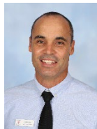
Wade Parker Middle School